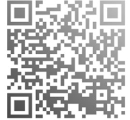
Youth Events This Week!!