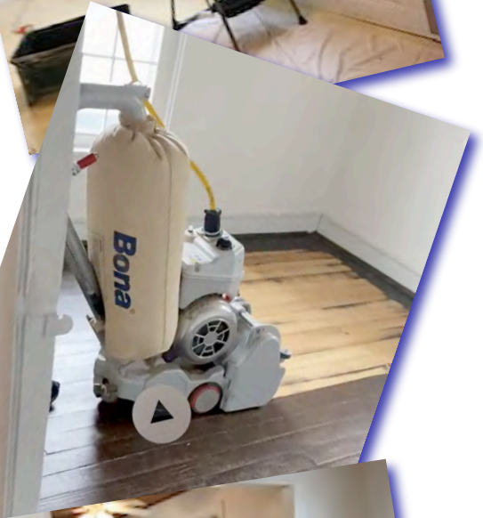
Before & After Floors