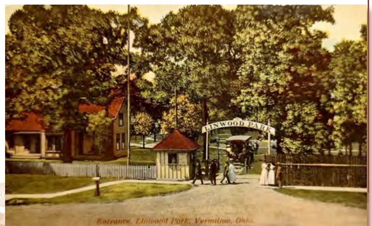
Entrance, Linwood Park, Vermilion, Ohio.